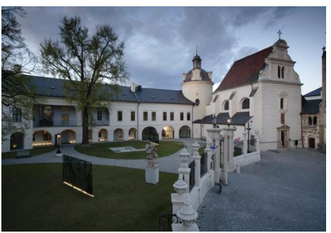
© Olomouc Archdiocesan Museum, Zdeněk Sodoma